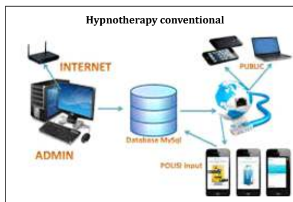
Figure 1. Technology Infrastructure from Manual to Mobile Apps "WAZZ Up, Doc?"

mobile apps "WAZZ Up, Doc?" is the identification of users by registering as a user and create a password, the identification problem by selecting the appropriate menu the patient's condition, start by turning on audio hypnosis therapy so as to balance a person's soul.