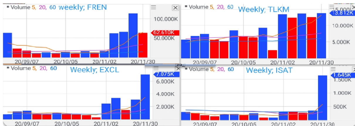
Figure 3. Volume Level of FREN, TLKM, EXCL, ISAT weekly basis for the period September - November 2020