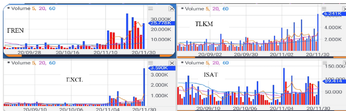
Figure 2. Volume Level of FREN, TLKM, EXCL, ISAT daily basis for the period September - November 2020

Fig. 4 shows that on the daily chart TLKM tends to have a decreasing volume after when