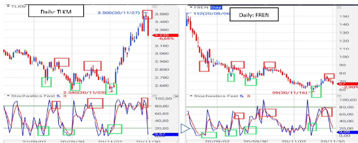
Figure 5. Daily Stochastic TLKM and FREN on the Indonesia Stock Exchange the period September - November 2020

Determination of buy and sell signals using Stochastic can also be seen through the intersection of the % K (red line) and % D (blue line). If the % K line crosses % D upwards, this is a buy signal. If the % K line crosses % D downwards it means a sell signal. Fig. 6 on the arrow in the green box there is a % K line that crosses % D upwards, this indicates a buy signal on TLKM and FREN. The arrow in the red box area has the % K line which cuts % D down, indicating a sell signal at TLKM and during this period the FREN shares did not have the