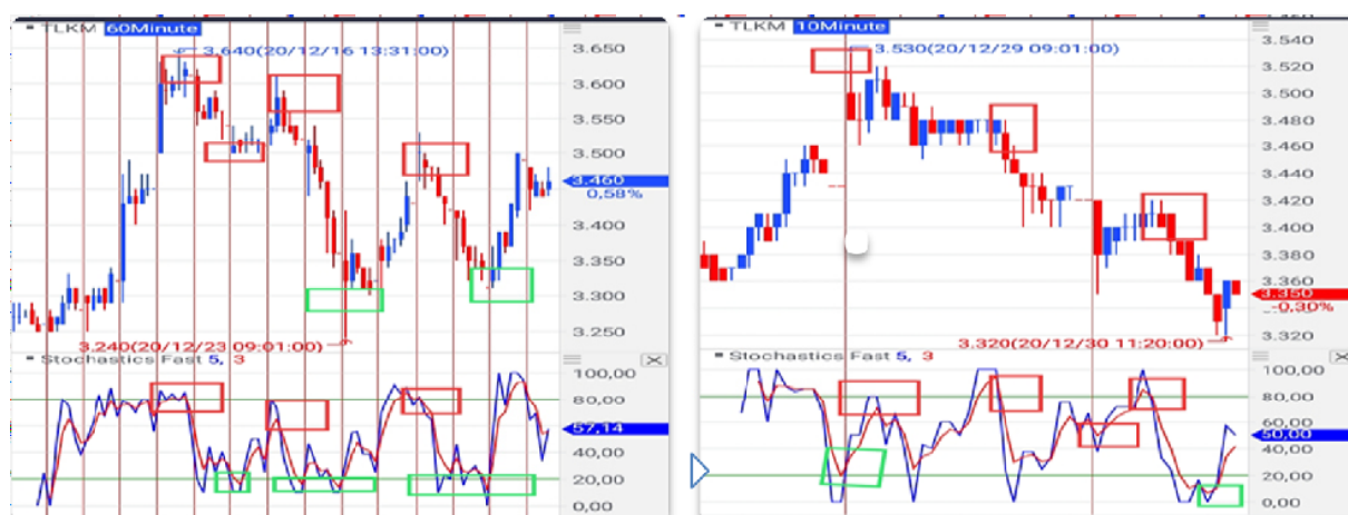
Figure 7. The hourly and per-minute buy and sell signals of TLKM stock on the same day period September - November 2020