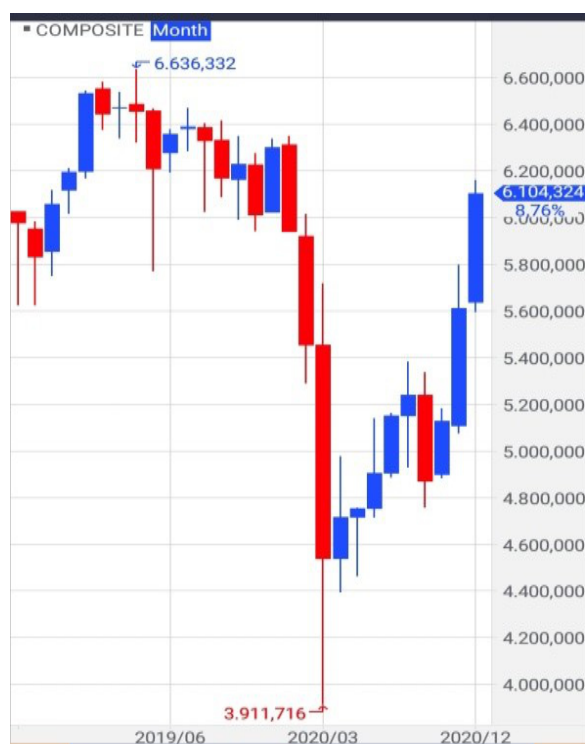
Figure 1. IDX Composite 2020

Investors' concerns over the impact of the Covid-19 pandemic's fundamental news on the performance of the industrial sector listed on The Indonesia Stock Exchange (IDX) led to high investor selling (Kartikaningsih. D & Nugraha, 2020). This is reflected in the drastic drop in the The IDX Composite starting when WHO (World Health Organization) officially announced a global health emergency due to the Covid-19 Pandemic on January 31st, 2020, and the The IDX Composite continued to decline when in March 2020 the Indonesian Government announced the first case of Covid-19 in Indonesia (Shiyammurti, N., & Saputri, D., & Syafira, 2020).