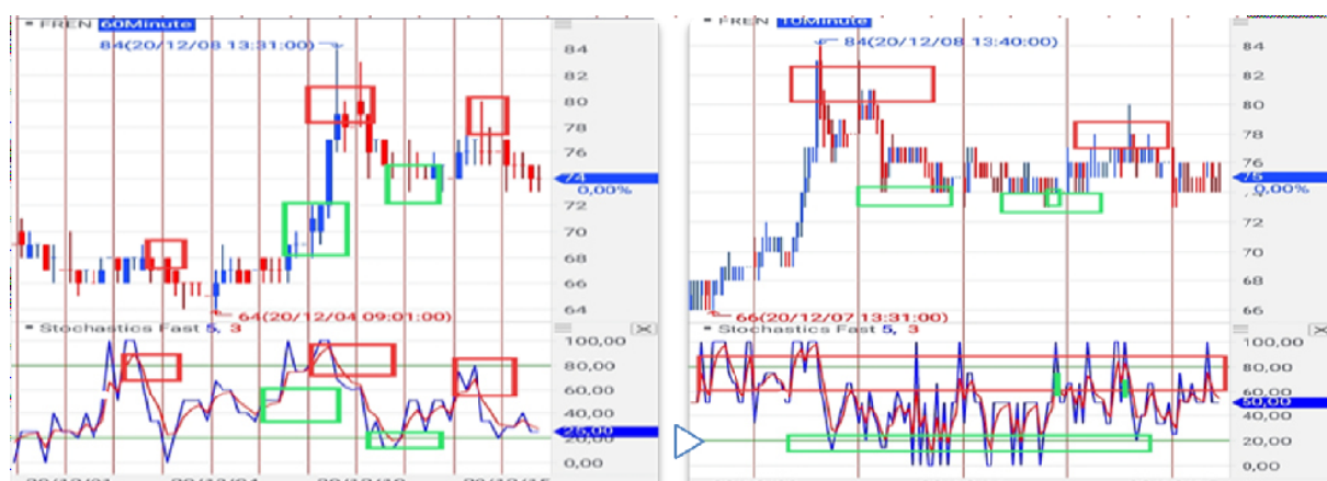
Figure 6. The hourly and per-minute buy and sell signals of FREN stock on the same day period September - November 2020

Figure 7 shows that the red box area (hourly Stochastic TLKM, on the same day) reflects that the price is moving in the range of the highest price (overbought) and this is the best momentum for "sell" positions. In the red box area (Stochastic TLKM per 10 minutes, at the same hour in the red box), TLKM price is moving